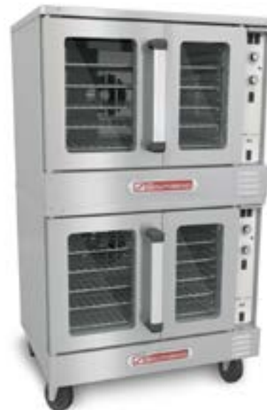
(shown with optional casters)

140°F to 500°F solid state thermostat and 60 minute mechanical cook timer.