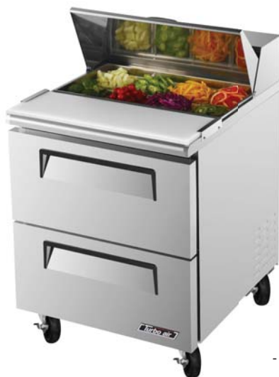
- Drawer pans not included.

EXCEPTIONAL 3 YEAR PARTS & LABOR WARRANTY