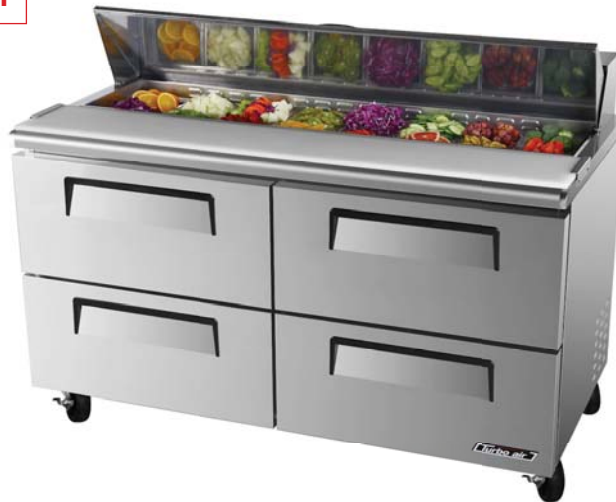
- Drawer pans not included.

EXCEPTIONAL 3 YEAR PARTS & LABOR WARRANTY