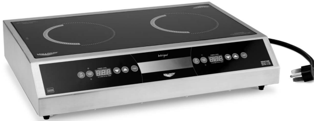
69523 - High-efficiency, heavy-duty, double element, countertop induction range with push button controls.

MODELS: 69523 5.0 kW/5.8 kW @ 208 - 240V (Dual Hob - Side-by-Side 2.5/2.9 kW per Hob)