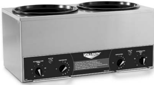
Twin 7 Quart Rethermalizer