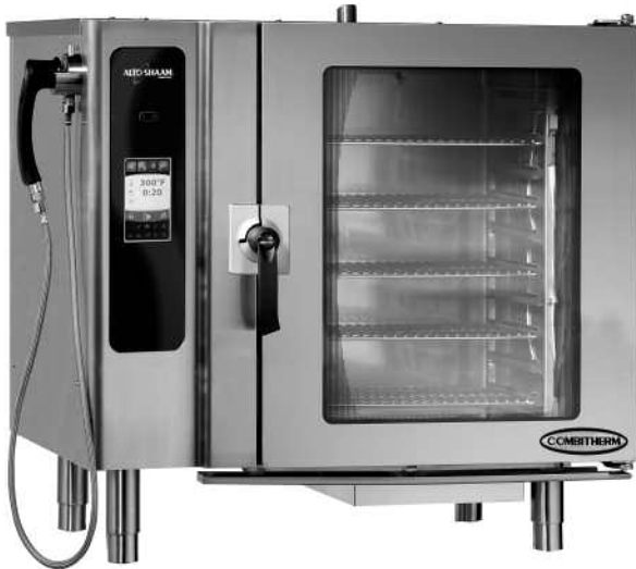
MODEL 10•10ES WITH COMBITOUCH CONTROL CAPACITY OF TEN (10) FULL-SIZE OR GN 1/1 PANS, TEN (10) HALF-SIZE SHEET PANS