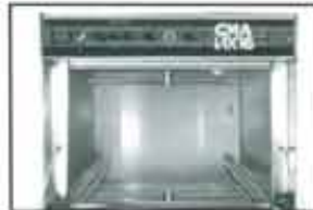
Upper and lower rotating wash arms guarantee excellent results.