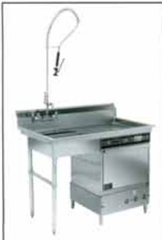
Optional dishtable, faucet and pre-rinse unit sold separately.