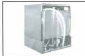
Pumped drain will drain uphill. Requires no floor drain.