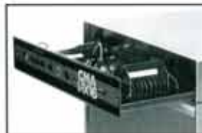
Convenient to service "Works-in-a-drawer", may be removed by unplugging one electrical connection.