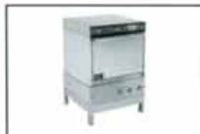
Optional pedestal allows the L-1X16 to be raised up to a full 12" off the floor for easy operator use. Height adjustable from 8" to 12".