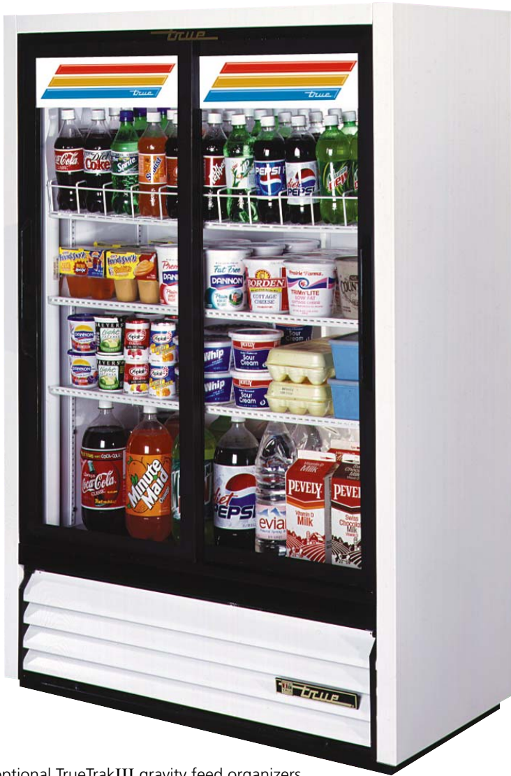
Shown with optional TrueTrakIII gravity feed organizers.