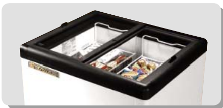
Shown with optional novelty wire baskets.