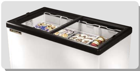
Shown with optional novelty wire baskets.