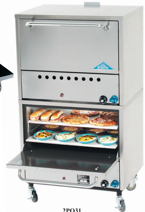
2PO31 (shown with optional casters)