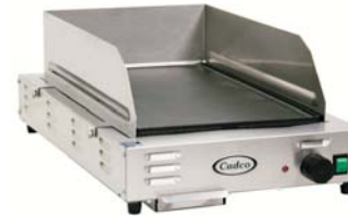
CG-5FB (Space Saver Front to Back Configuration) 120 volts/1500 watts/12.5 amps NEMA 5-15P Plug