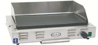
CG-10 120 volts/1500 watts/12.5 amps NEMA 5-15P Plug