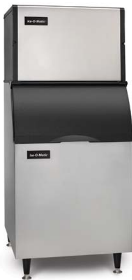
ICE 500 ON B55

Ice-O-Matic modular cubers are designed to provide the highest reliability, with carefree operation and maintenance. They produce pure, crystal-clear ice for the most demanding foodservice and hospitality needs. Half and full cube configurations are available.