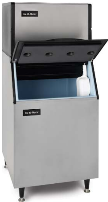
ICE 400 ON B55

Ice-O-Matic ICE Series cube machines produce full, half or gourmet cube sizes. Our modular cube ice machines boast these state-of-the-art-features: