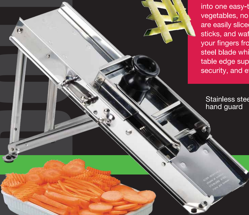
Stainless steel hand guard