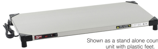
Shown as a stand alone counter-top unit with plastic feet.