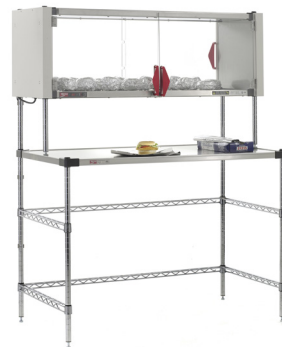
Heated shelf enclosure kit shown with a Super Erecta workstation.