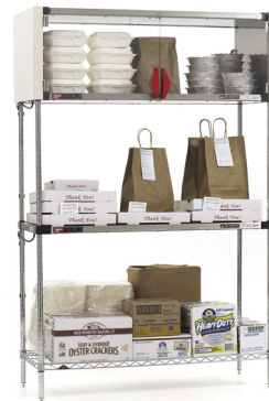
Shown with heated shelf, enclosure kit and standard Super Erecta shelving.