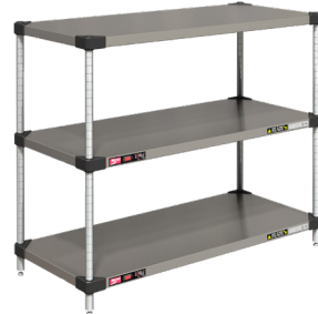
Shown as a tiered shelving unit.