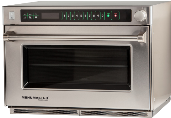
Model MSO35 shown