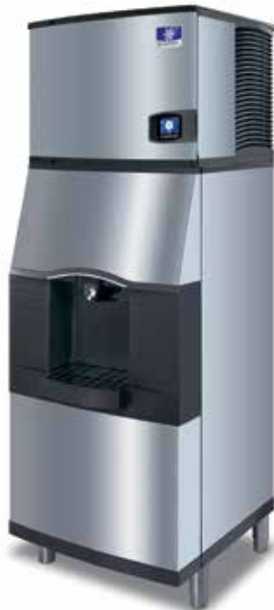
Indigo NXT iT0450 Ice Machine SPA-310 Ice Dispenser

With Indigo and Indigo NXT ice machines you can program the ice machines to be off certain hours of the day so that while the hotel guests are sleeping, the ice machine can be too!