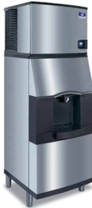
Indigo NXT iT0450 Ice Machine SFA-291 Ice & Water Dispenser