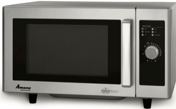
Model RMS10DS shown