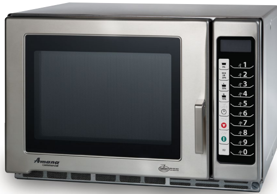
Model RFS18TS shown