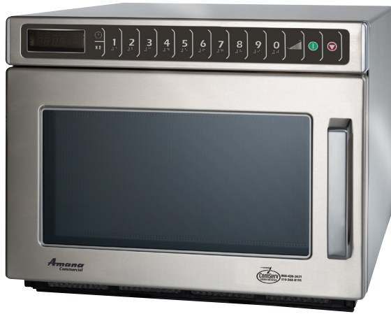
Model HDC212 shown