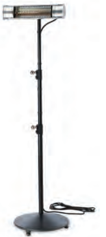
Shown with Optional Stand CV-EH-STAND-3