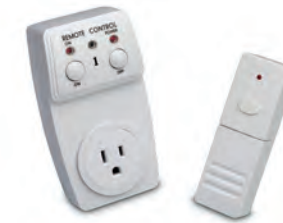
Optional Remote Control CV-EH-REM-1 (not exactly as shown)