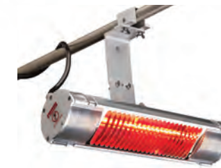
Optional Universal tent mounting bracket CV-EH-BRKT-1