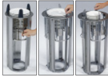
1. Height Adjustment – Simply detach or attach springs to adjust tension for the height level you desire. 2. & 3. Adjust-a-Fit® Size Adjustment – Easily re-position and lock the dish guides with a turn of the wrist. No tools necessary!