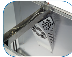
Forced Air Fan