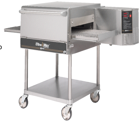
UM-1854 (Single) with Optional Stand