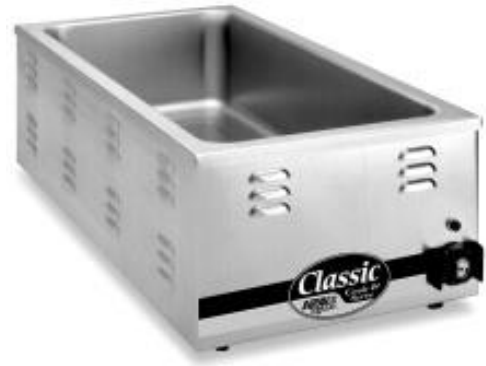
Model CW-3A Countertop Cooker

*Warranty does not include rock grates, cooking grates, burners shields or fireboxes.