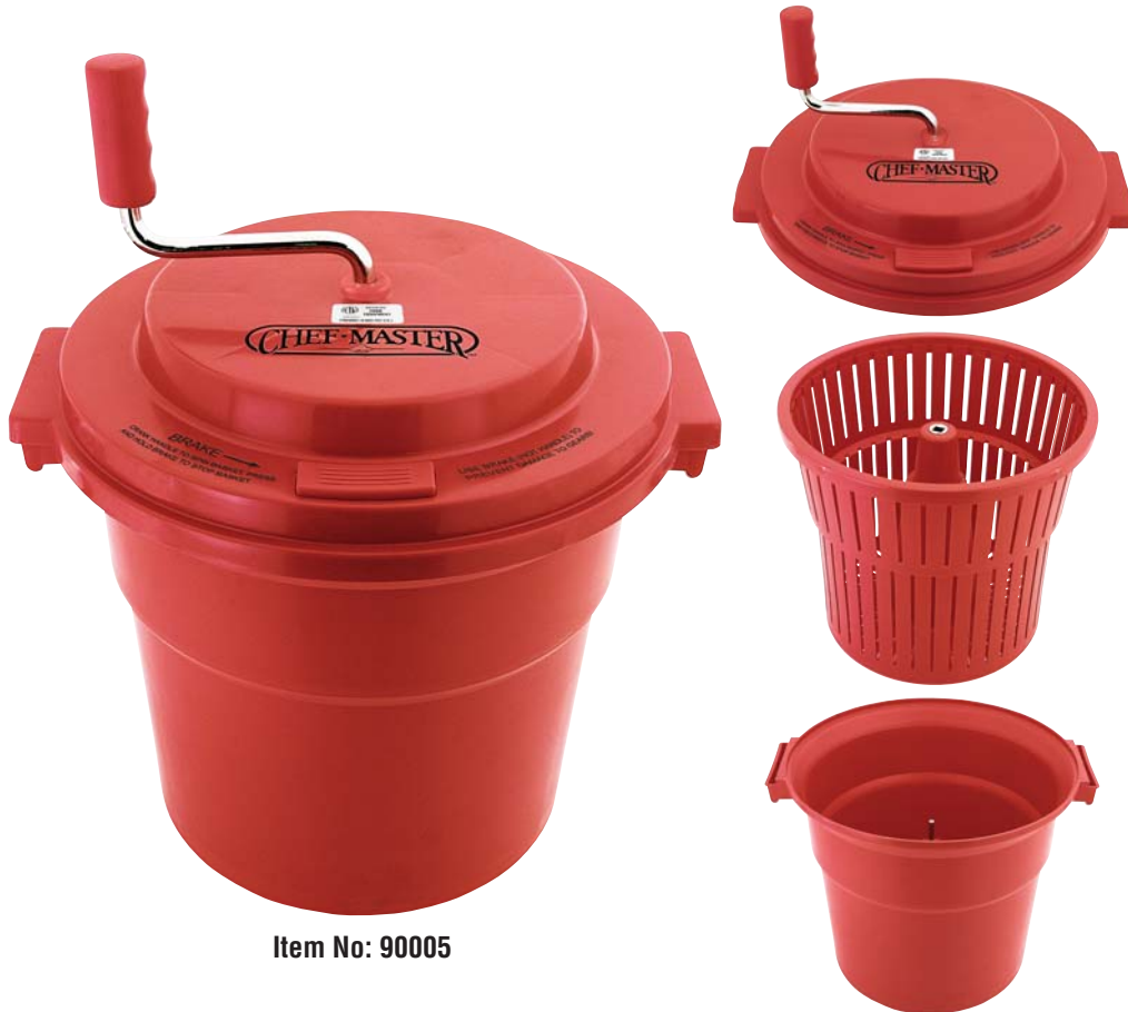
Item No: 90005