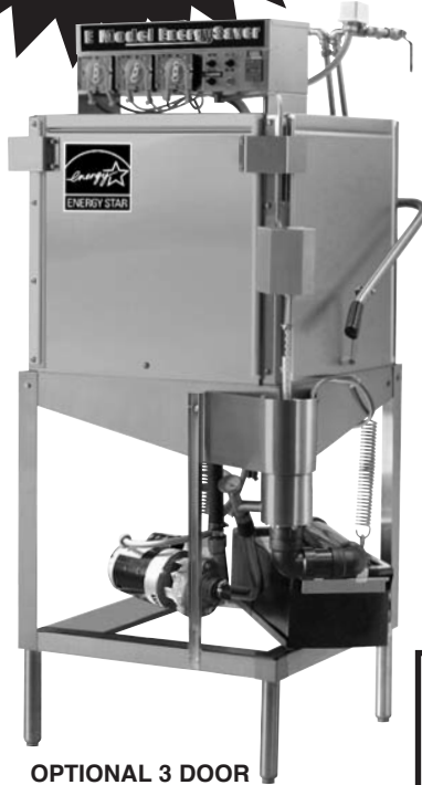
OPTIONAL 3 DOOR MODEL AVAILABLE FOR STRAIGHT AND CORNER OPERATION