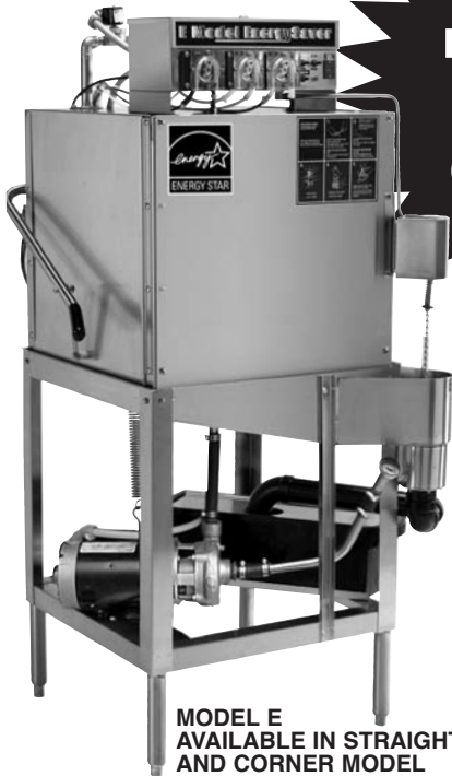
MODEL E AVAILABLE IN STRAIGHT AND CORNER MODEL

USES ONLY 1.01 Gallons Of Water Per Cycle!