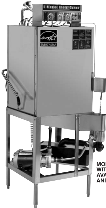
MODEL E EXT WITH 20-1/2" DOOR OPENING AVAILABLE IN STRAIGHT AND CORNER MODEL