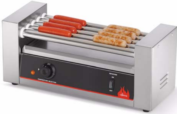
Cayenne® Hot Dog Roller Grill