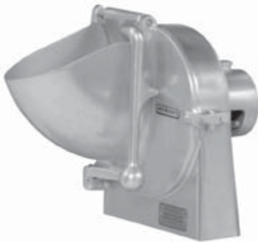
9" VEGETABLE SLICER

The 9" Vegetable Slicer may also be used with the PD-35 or PD-70 Power Drive units.