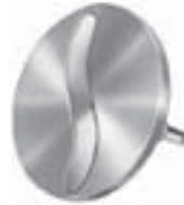
Adjustable Slice Plate - \frac{5}{8} " to very thin.