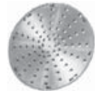
\frac{5}{16} " Shredder Plate