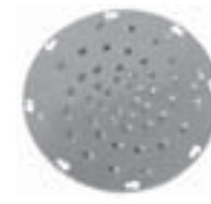
\frac{1}{2} " Shredder Plate