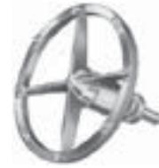
Plate Holder Assembly